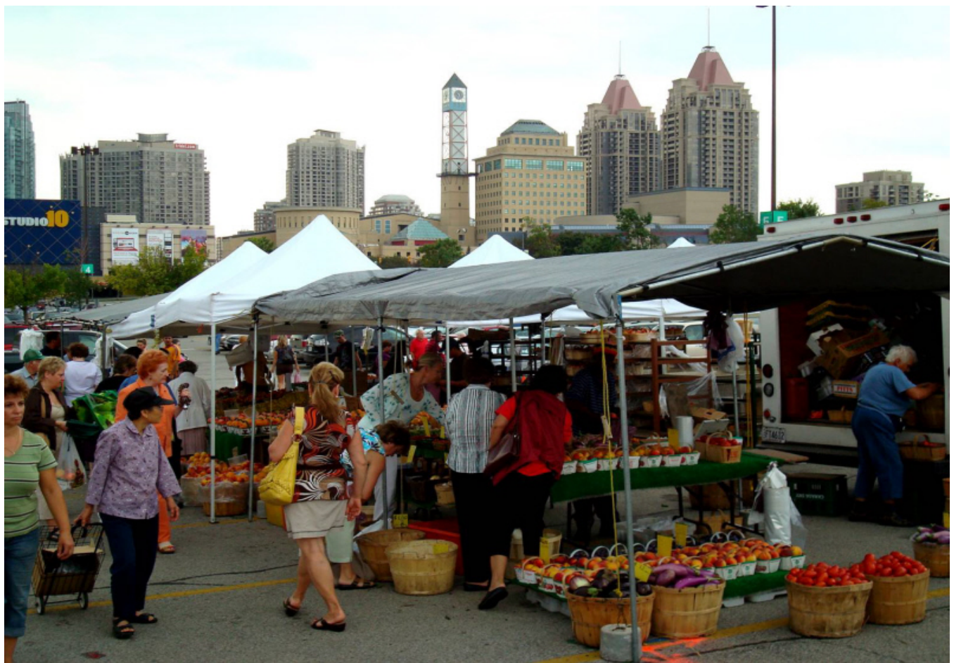
Figure 1-1: Formed in 1974, Mississauga is recognized as Canada's sixth largest city and Ontario's third largest city, with a population of over 730,000 residents representing cultures from around the world. Mississauga has many attractions and events that run at various times throughout the year. The Downtown is a central spot for activities, including the Farmers' Market.

Mississauga Official Plan provides a new policy framework to protect, enhance, restore and expand the Natural Heritage System, to direct growth to where it will benefit the urban form, support a strong public transportation system, and address the long term sustainability of the city. Mississauga Official Plan will be an important instrument in city building. All change within the urban environment will be considered for its capacity to create successful places where people, businesses and the natural environment will collectively thrive.