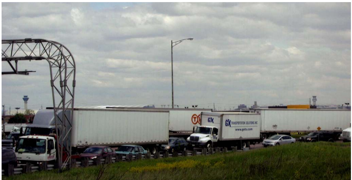
Figure 8-10: Several 400 series highways and major roads traverse Mississauga and support the many businesses reliant on efficient goods movement.

8.7.2 Activities generating substantial truck traffic will be encouraged to locate near or adjacent to provincial highways and arterial roads.