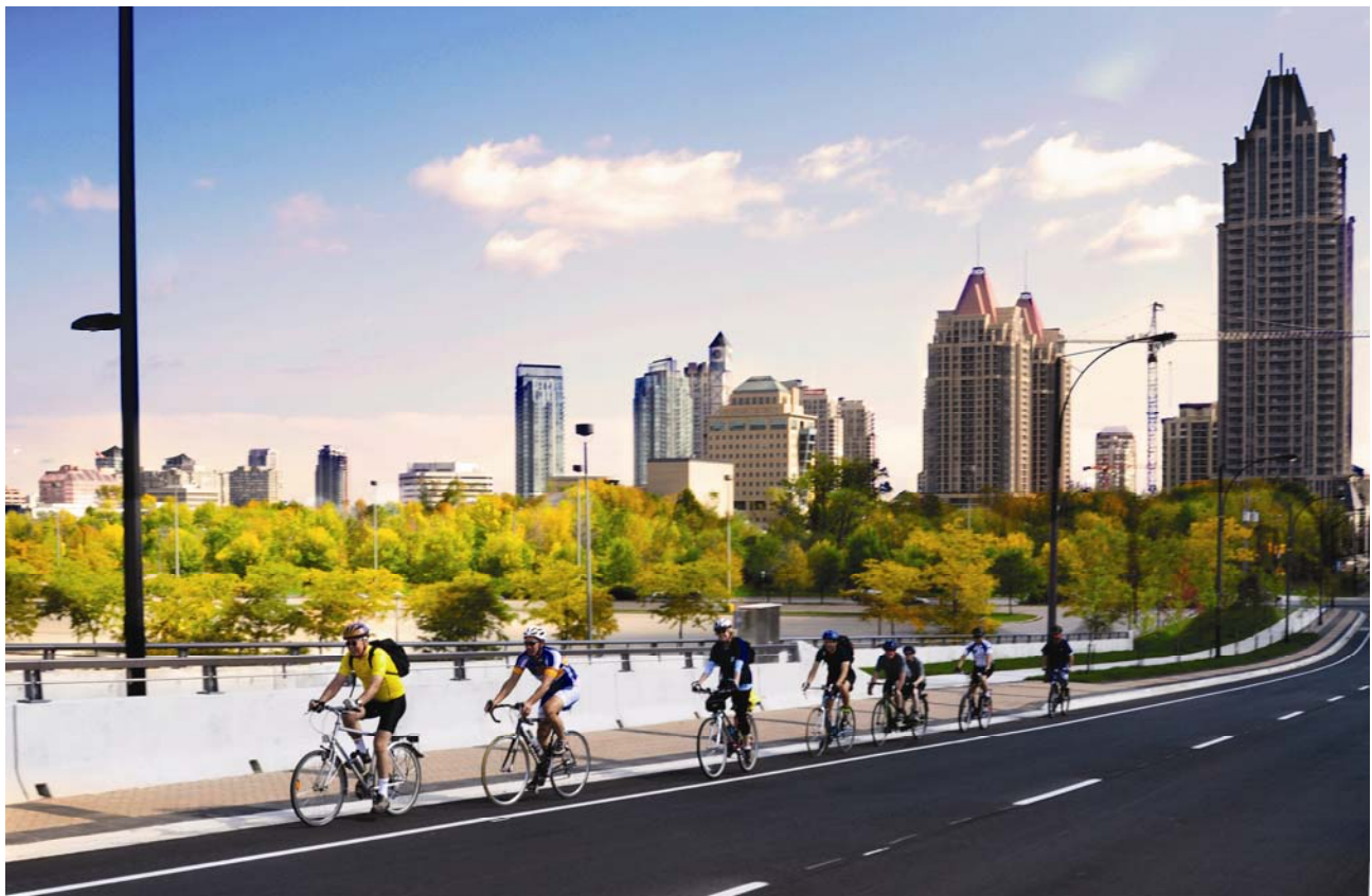
Figure 8-1: Mississauga promotes a range of transportation modes. In addition to providing for the car, facilities for transit, cycling, and walking are a priority. Promoting a range of transportation choices will be particularly important in areas where intensification is encouraged, such as in the Downtown.

Mississauga is evolving from a city that has a suburban, vehicle oriented built form to a more urban municipality. The transformation of the transportation system to meet the needs of the future is not without significant challenge. Mississauga's transportation infrastructure, which is largely built and relatively new, was designed around a grid of widely spaced major roads designed to move large volumes of vehicles efficiently. Within