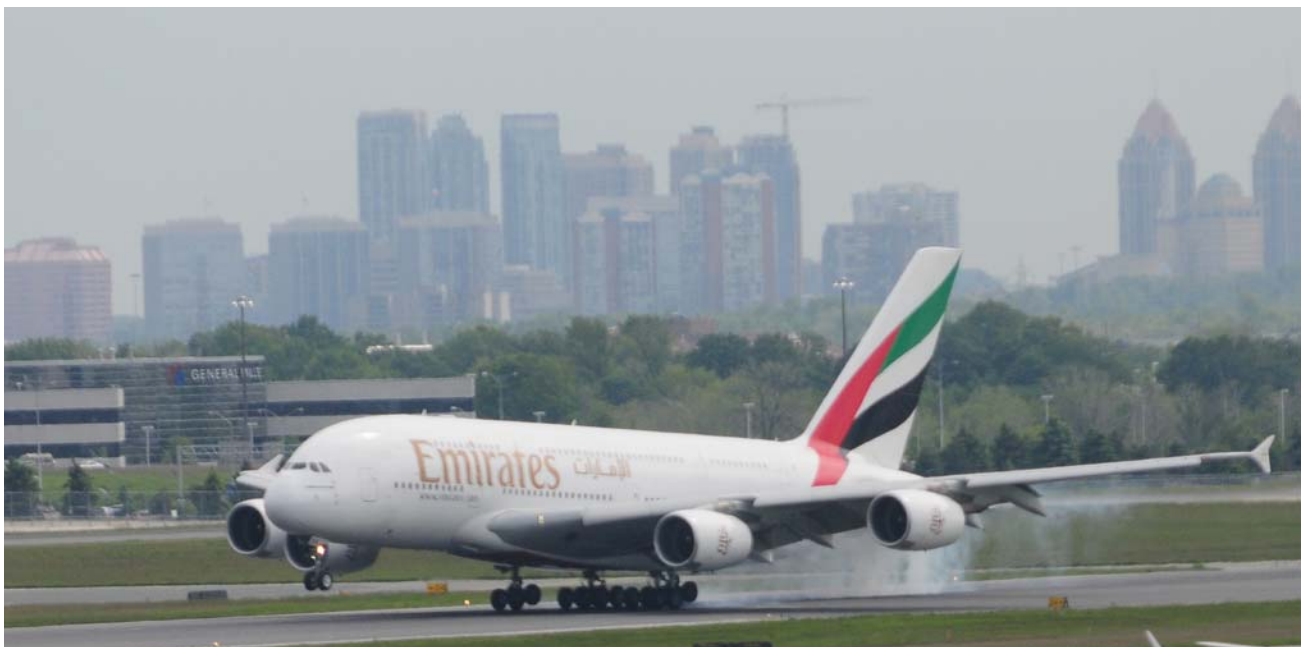
Figure 8-12: The Airport supports the local and regional economy and is a significant component in the city's transportation network.

Canada's largest airport is a major transportation facility and destination within Mississauga, serving an important regional, national and international role.