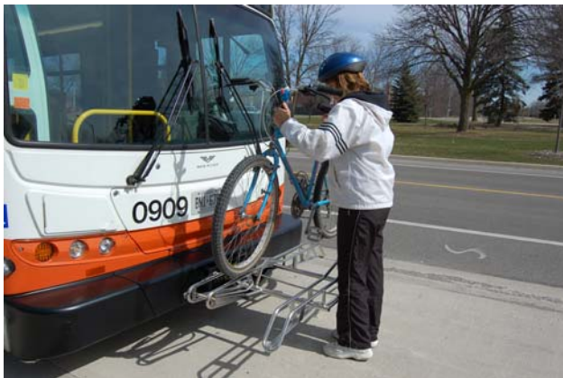
Figure 8-6: People often use multiple modes of transportation in their daily commute. Supplying bike racks on buses is one example of how Mississauga supports cycling.

The purpose of Schedule 7: Long Term Cycling Routes is to connect key city destinations and locations, such as Major Transit Stations, with cycling routes and provide cycling linkages to adjacent municipalities. The cycling facilities shown on Schedule 7 consist of Primary Off-Road Routes, Primary On-Road / Boulevard Routes, Primary On-