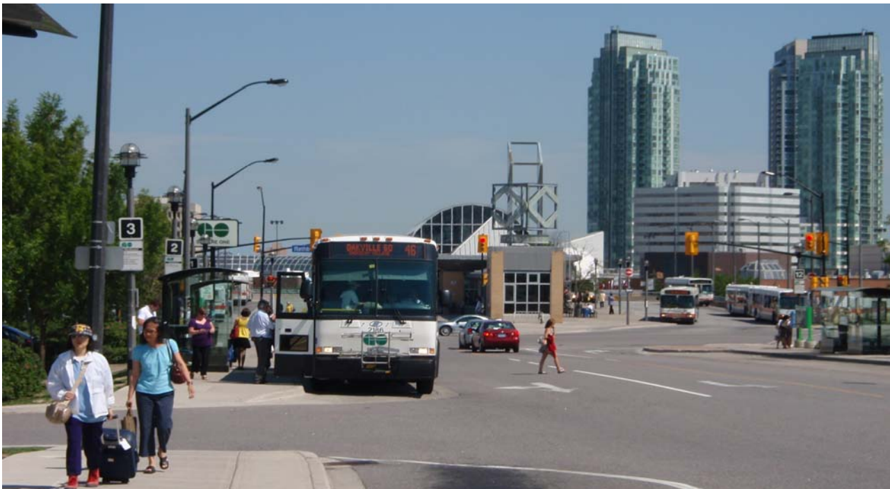
Figure 8-9: The Downtown Core Mobility Hub is an example of where people can live, work, shop and recreate in a mixed use environment supported by transit.

8.5.9 Further TDM policies may be identified through a Transportation Master Plan.