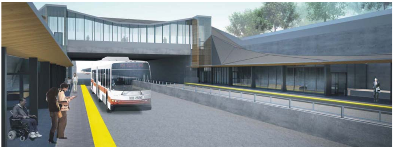
Figure 8-4: Higher order transit such as the Highway 403/Eglinton Bus Rapid Transit will provide competitive alternatives to the automobile.

Implementation measures such as transit priority and alternative on demand service providers will be considered to promote transit as a preferred transportation option that is accessible to people of all abilities.