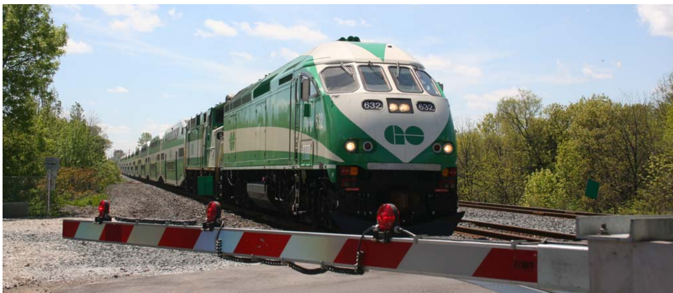
Figure 8-11: The rail corridors in Mississauga are shared by both freight and passenger trains, such as the GO train depicted above. The City recognizes these corridors as assets in the transportation system.