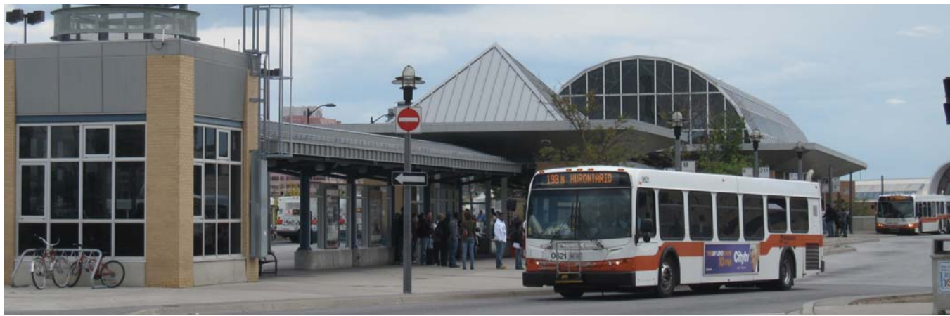
Figure 8-5: Various transportation forms exist within the city. The transit network is extensive and serves the large resident population and employment base, as well as those passing through the city.

8.2.3.1 Mississauga will seek to develop and maintain a system of transit services aimed at providing a competitive alternative to the automobile, for access throughout the city and neighbouring municipalities.