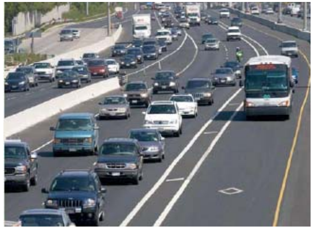
Figure 8-8: High Occupancy Vehicle (HOV) lanes such as those on Highway 403, encourage people to carpool or take transit.

Transportation demand management (TDM) measures encourage people to take fewer and shorter vehicle trips to support transit and active transportation choices, enhance public health and reduce harmful environmental impacts. TDM is