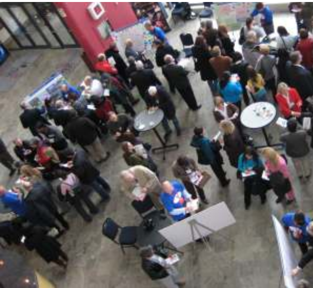
Figure 4-16: As part of the Strategic Plan public engagement process, connections were made with over 100 000 people. The Mississauga Official Plan implements the land use components of the Strategic Plan.