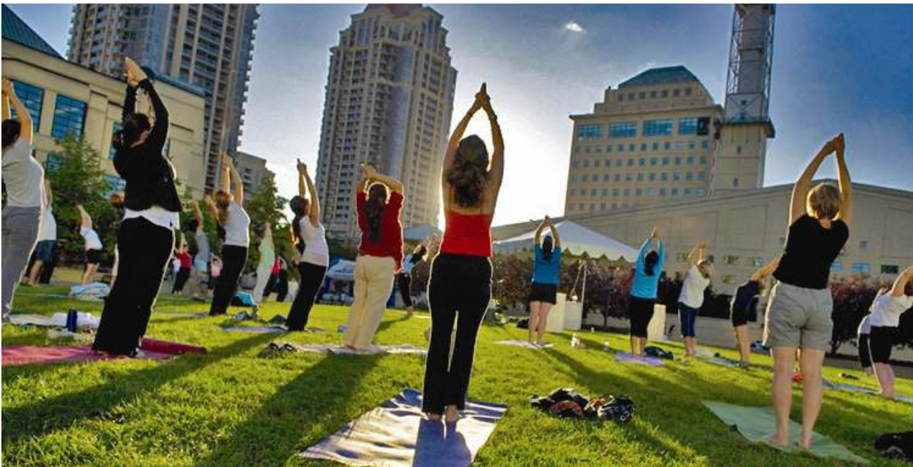
Figure 4-12: Complete communities preserve historic and cultural resources and support artistic expression and individual community designs that promote healthy lifestyles.