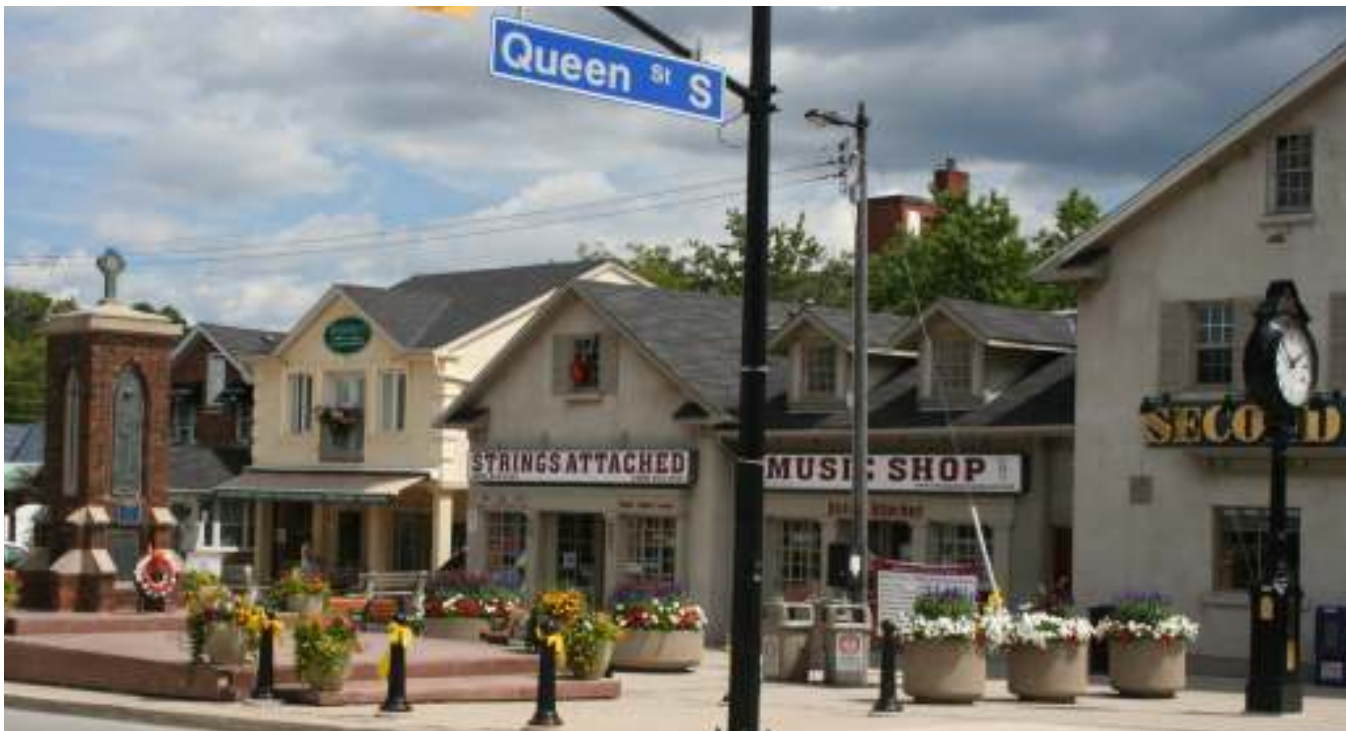
Figure 4-14: Streetsville is a vibrant mixed use community that has a rich history and a strong civic identity.

Placemaking is not just the act of building or fixing up a space, but a whole process that fosters the creation of vital public destinations: the kind of places where people feel a strong stake in their communities and a commitment to making things better. Simply put, Placemaking capitalizes on a local community's assets, inspiration, and potential, ultimately creating good public spaces that promote people's health, happiness, and well-being.