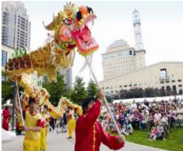
Figure 4-6: Mississauga welcomes the more than 50% of its population born outside of Canada, in many cultural festivals throughout the year.

As Canada’s sixth largest city, Mississauga has been one of the fastest growing and most economically successful cities in the country. In 1976, the city had a population of approximately 250 000 and supported more than 130 000 jobs. In 2009 these figures increased to 730 000 people and 453 000 jobs.