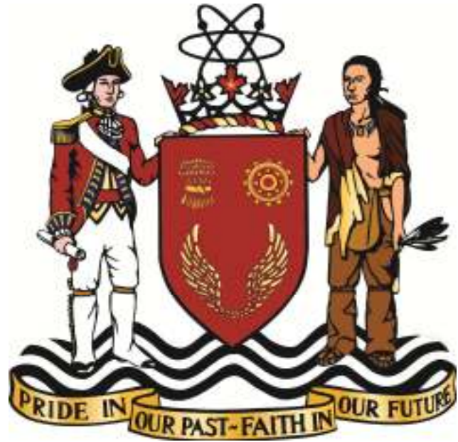
Figure 4-17: Through its various images, the Mississauga Coat of Arms conveys the past, present and future of a City proud of its growth and confident of its future.

Although there may be some variation to the sequence and approach to the implementation of the Strategic Plan as expressed through Mississauga Official Plan, the city vision and key guiding principles, upon which the Plan is based, will continue to remain intact. Through the sustainable management of growth and land, Mississauga Official Plan will guide the physical evolution of Mississauga where present and future generations will continue to thrive.