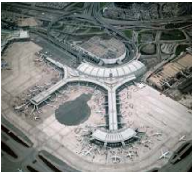
Figure 4-4: The development of the Toronto - Lester B. Pearson International Airport effectively prohibits new residential uses in the city's northeast due to requirements that sensitive land uses be distanced from higher airport noise levels. Although the airport has implications on land use, it is a major transportation hub that is vital to Mississauga's economy.

In 1974, the Town of Mississauga amalgamated with Port Credit, Streetsville and portions of the Townships of Toronto and Trafalgar to form the City of Mississauga.