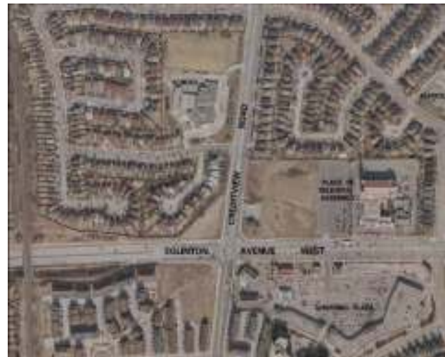
Figure 4-5: Grid roads gave way to circuitous road patterns and cul-de-sacs to discourage traffic from cutting through neighbourhoods; tall noise walls were erected along major streets to shield neighbourhoods from traffic noise.

As the population grew from 33 000 in 1951, infrastructure improvements, residential expansion, and industrial and commercial development ensued. Lands were no longer developed into small town scaled parcels but instead large tracts of land were planned for residential and industrial subdivisions. In general, residential and industrial/employment uses were separated in the city.