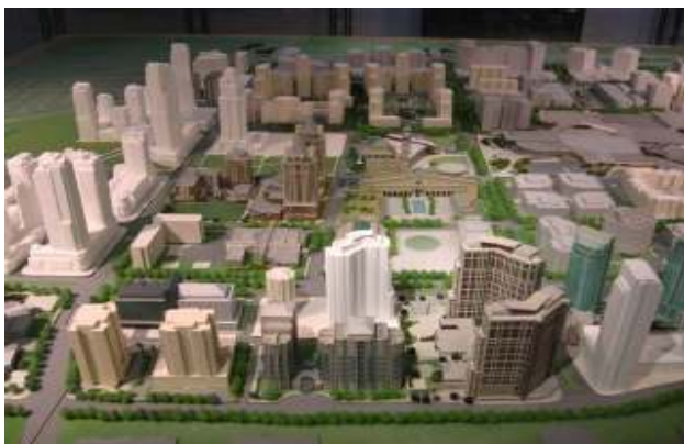
Figure 4-10: Growth will be directed to areas identified for intensification such as the Downtown Core. The above model illustrates actual and potential development within the Downtown Core, helping to visualize how new growth will relate to existing structures.

As Mississauga continues to evolve, growth will be strategically managed by determining the appropriate arrangement and balance of land uses, including population and employment densities. Growth will be directed to key locations to support existing and planned transit and other infrastructure investments. Growth will not be directed to areas of the city that need to be preserved and protected (e.g. stable residential areas, Natural Areas System and cultural heritage resources).