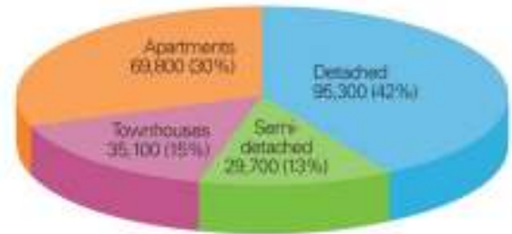
Figure 4-7: In Mississauga, housing choices are available for a range of household sizes and types, including working families, singles and seniors.

They not only want to raise their families in the community but they also want to spend their senior years in communities that offer appealing amenities and healthy, urban lifestyle options.