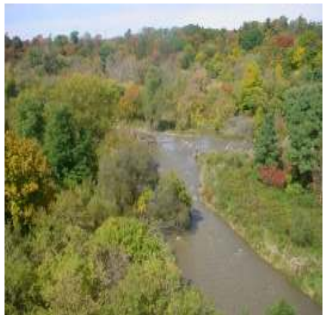
Figure 4-11: Located on the scenic east bank of the Credit River, over two thirds of Riverwood Park's 60+ ha will be preserved, to provide and protect the habitat for over 359 species of native plants and 46 species of birds and animals.

Mississauga has natural areas of exceptional beauty and quality. Mississauga will serve as a steward of