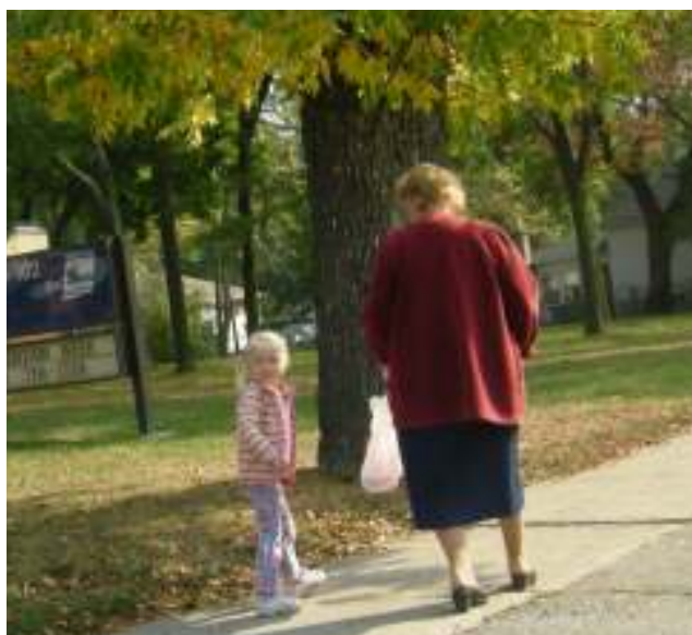
Figure 4-9: Mississauga is home to residents of all ages who thrive in their communities.

Mississauga Official Plan has been prepared to assist in the implementation of the long term vision formulated through a comprehensive public engagement process known as, "Our Future Mississauga – Be Part of the Conversation" that resulted in a new Strategic Plan. The goals,