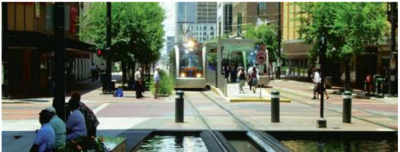
Figure 4-13: Transit and active transportation is a priority for Mississauga's urban vision. (Houston, Texas)