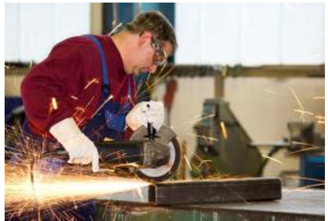
Figure 4-8: Mississauga must continue to maintain a supply of traditional employment lands to maintain current and future needs.

With a thriving and diverse economy, Mississauga boasts more than 60 “Fortune 500” companies representing a variety of employment sectors. Employment continues to remain strong, and Mississauga is expected to maintain its current role