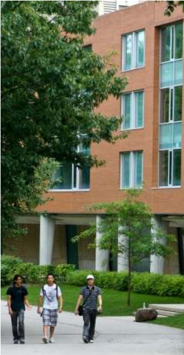
Figure 4-15: Mississauga's educational opportunities are important resources, providing talent to meet the needs of existing and future employers.

Mississauga has a progressive and diversified economy. Maintaining its current strength, while further diversifying its base by affording the opportunity for people of all ages and backgrounds to thrive, will be important for its future success. The City will foster innovative and creative businesses by capitalizing on a dynamic downtown, attractive corporate centres and hi-tech infrastructure, and by enabling the efficient movement of goods.