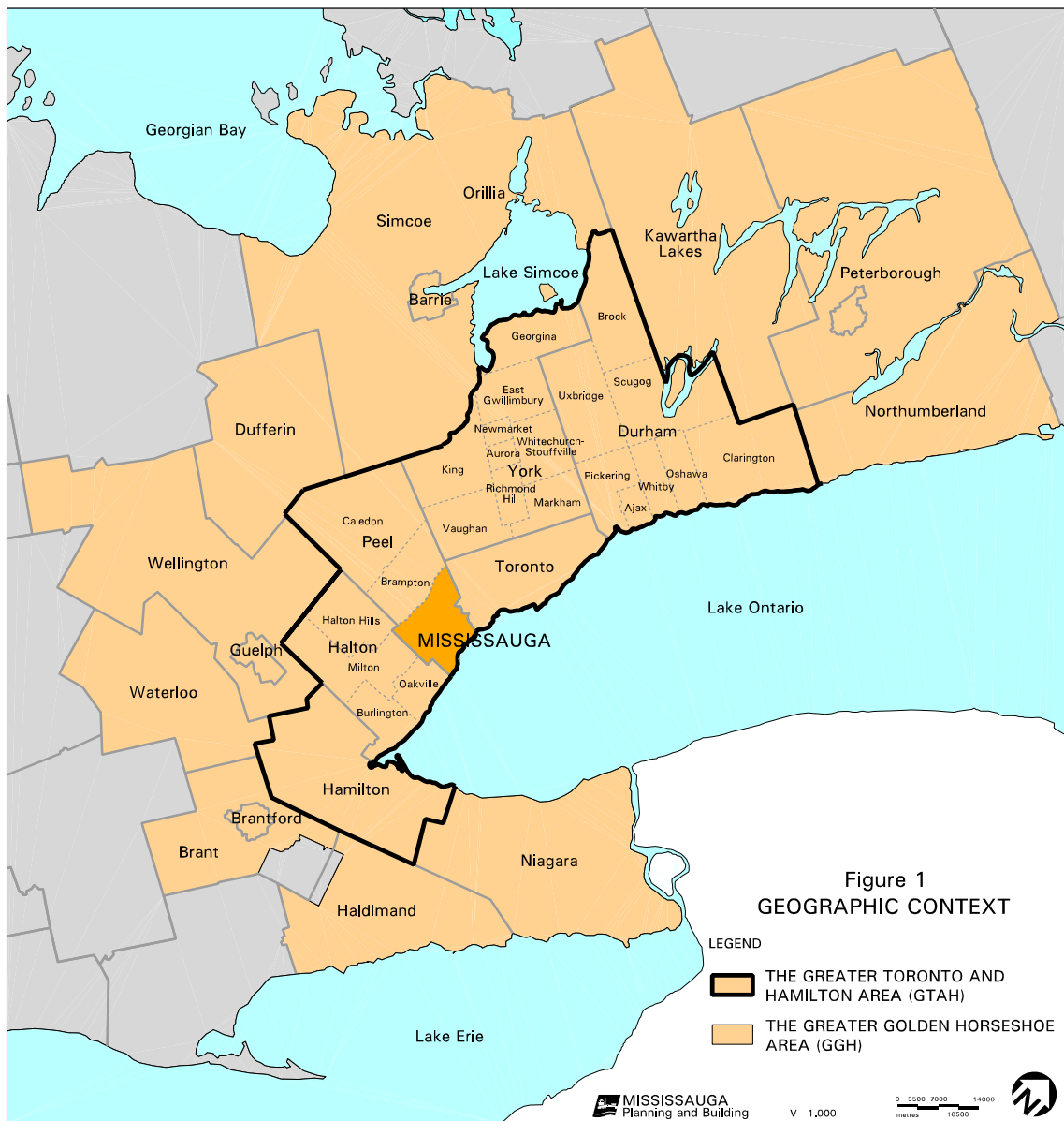
Figure 4-1: Mississauga is situated near the centre of the Greater Golden Horseshoe, one of the fastest growing regions in North America.

diversified economy supported by a range of mobility options and a variety of housing and community infrastructure to create distinct, complete communities. To achieve this vision the City will revitalize its infrastructure, conserve the environment and promote community participation and collaboration in its planning process.