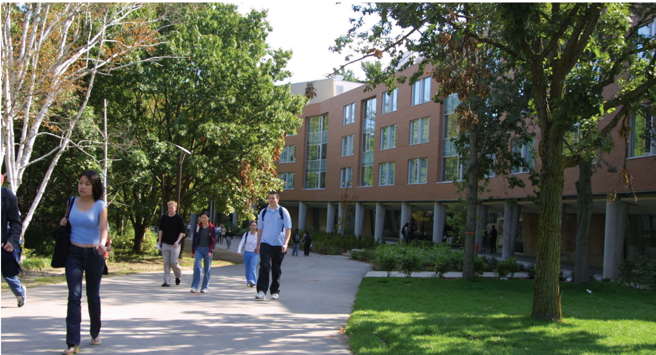
Figure 10-7: The University of Toronto Mississauga (UTM) has greatly expanded over the past few years. The university has built additional educational, recreational and housing structures for student use. Mississauga looks forward to working with other universities and colleges, who choose to locate within the city, to create new campuses with similar amenities as UTM.

Post-secondary institutions can attract and support the growth of strong, innovative businesses, and further the needs and interests of youth, older adults and recent immigrants to Mississauga. Improved transit facilities and providing for a range of suitable, affordable housing choices are key to attracting new post-secondary schools, colleges and universities to Mississauga.