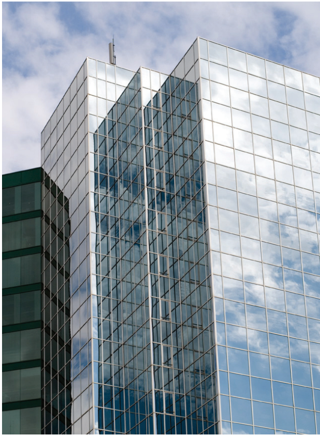
Figure 10-4: Over the years Mississauga has been able to attract many diverse businesses. Many of these offices have concentrated in the city's Corporate Centres, Employment Areas and Downtown. In the future, the City will promote increased office use and activity within the Downtown.

10.2.3 Outside of Employment Areas, secondary office development will be encouraged to locate within Community Nodes and Major Transit Station Areas .