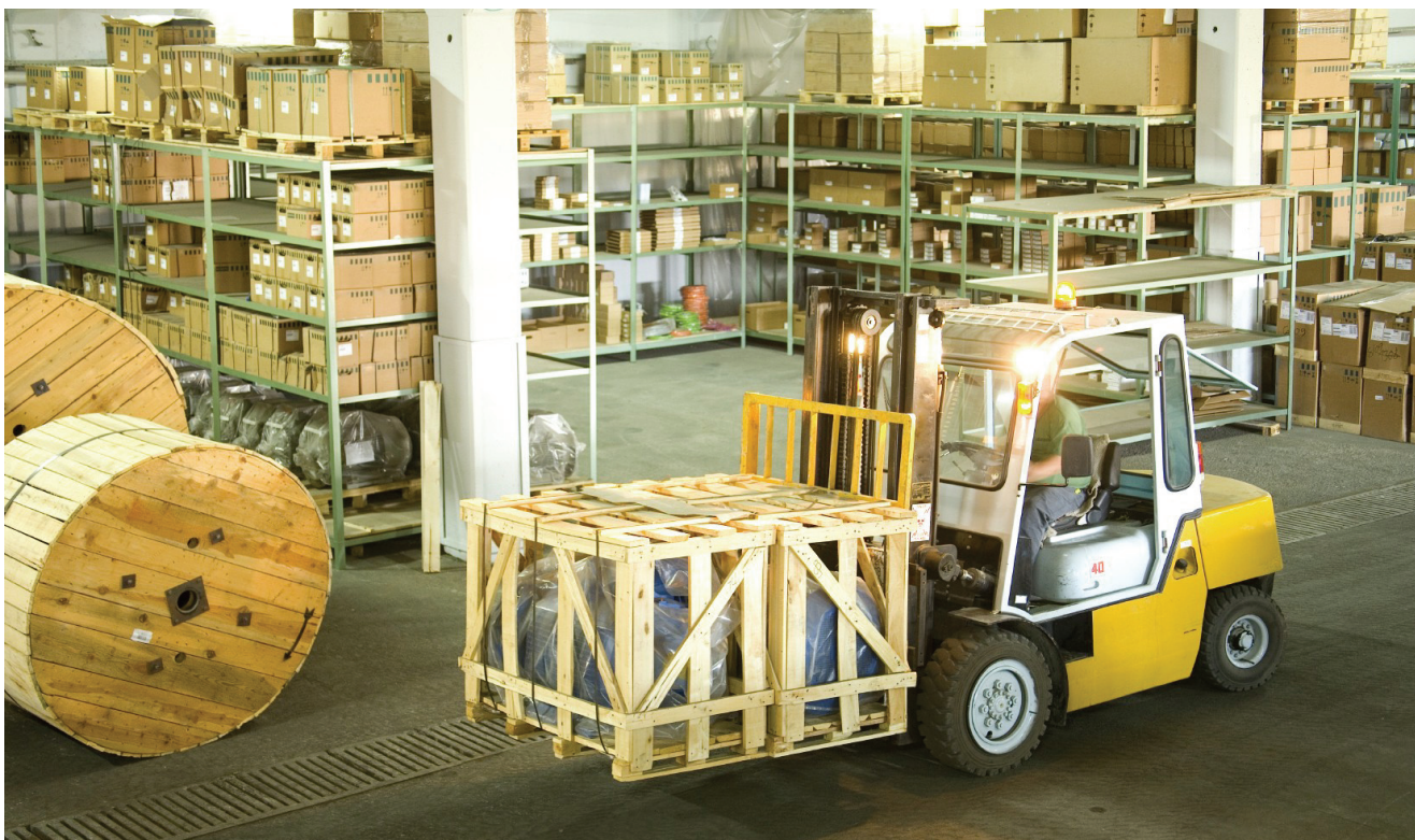
Figure 10-5: Mississauga is home to many warehousing and distribution centres, providing many employment opportunities within the city. These types of uses, along with other industrial uses, are best served by locating within Employment Areas away from sensitive land uses.