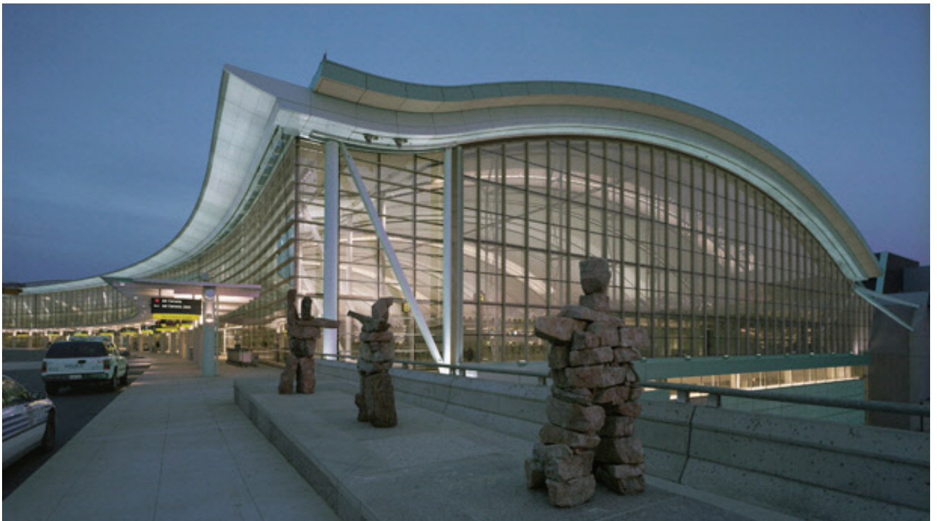
Figure 10-1: There are over 420 000 employment opportunities in Mississauga providing jobs for local as well as regional residents. While the largest concentration of these employment opportunities is in the northeast quadrant of the city at the Airport and surrounding lands, Mississauga has a number of other thriving employment areas. Mississauga has been highly successful in attracting office employment and over the last 25 years the city has developed an average of approximately one million square feet of office space annually. (Robert Speck Parkway Business Area, Hewlett-Packard Building, Airport -Terminal 1)