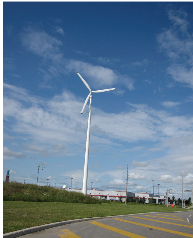
Figure 10-11: A 31 m wind turbine unveiled at the Lisgar GO Station in April 2009, generates as much as 80 per cent of the station's power. The site, located at Tenth Line and Argentia Road, was chosen for the wind turbine because of heavy prevailing winds from the west and its open fields.

10.7.7 Mississauga will promote public awareness and education initiatives jointly with other levels of