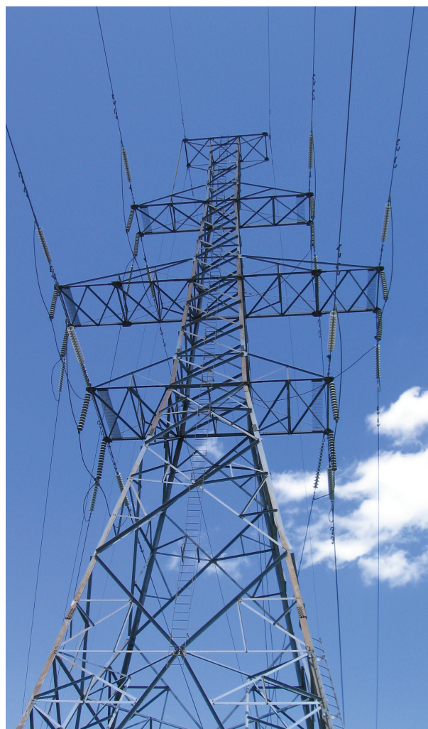
Figure 10-10: Mississauga Official Plan provides opportunities for power generation and distribution facilities situated in appropriate locations.

Energy efficiency and improved air quality through land use, development patterns and efficient transportation, are important for the health of Mississauga's population, economic prosperity and