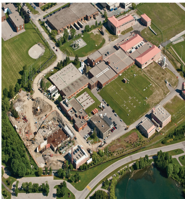
Figure 10-8: The 27 hectare Lakeview Water Treatment Facility is located on the shore of Lake Ontario in Mississauga and is operated by the Region. The Region has identified the need for a capacity expansion of the facility as a result of increased growth to serve the eastern part of Peel and to meet servicing requirements in York Region. The expansion of the Lakeview plant will increase capacity to produce 1 150 million litres of water per day.

10.6.6 Where possible, the existing conditions should be augmented by the re-establishment of native vegetation and the preservation of existing landforms, vegetation and drainage patterns. Where possible, at-source controls should be provided to reduce the need for new infrastructure. All efforts to this effect should be guided by the appropriate