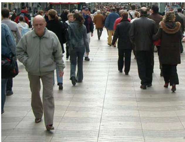
Figure 10-2: Retaining areas for employment purposes is vital to the health and competitiveness of the city. As the city's population grows through intensification and redevelopment, it will be critical to maintain the existing employment base and to provide opportunities for future employment.

Mississauga is home to a well educated labour force. Ensuring that residents have access to opportunities to develop the skills and knowledge needed to meet the needs of the business community is critical to the city's continued economic success. Mississauga is home to The University of Toronto Mississauga and the Sheridan College campus in the Downtown. In addition to these post-secondary institutions, the City promotes the establishment of new universities and colleges so that local students have a variety of learning opportunities within their community. This will also attract new residents to the city to further their education, retain youth and encourage partnerships between academic institutions and businesses.