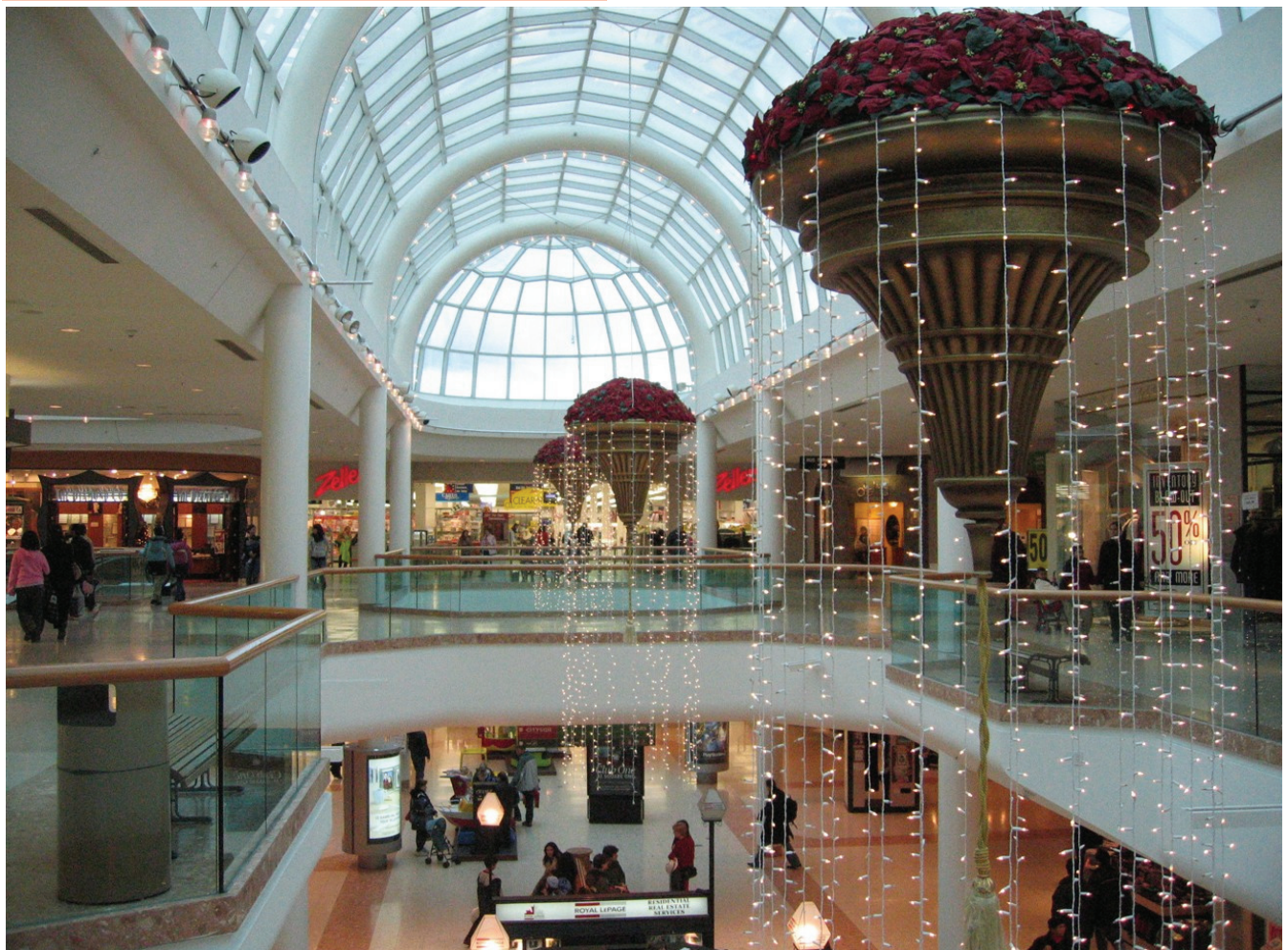
Figure 10-6: Commercial uses are a staple for everyday living. These uses will be concentrated in the Downtown, Major Nodes and Community Nodes. Some retail services will be provided in Neighbourhoods. Not only is the location of commercial uses important in servicing residents, but the scale and design of these structures is important in creating a comfortable sense of place where people want to gather.

10.4.1 Retail uses are encouraged to locate primarily within the Downtown, Major Nodes and Community Nodes.