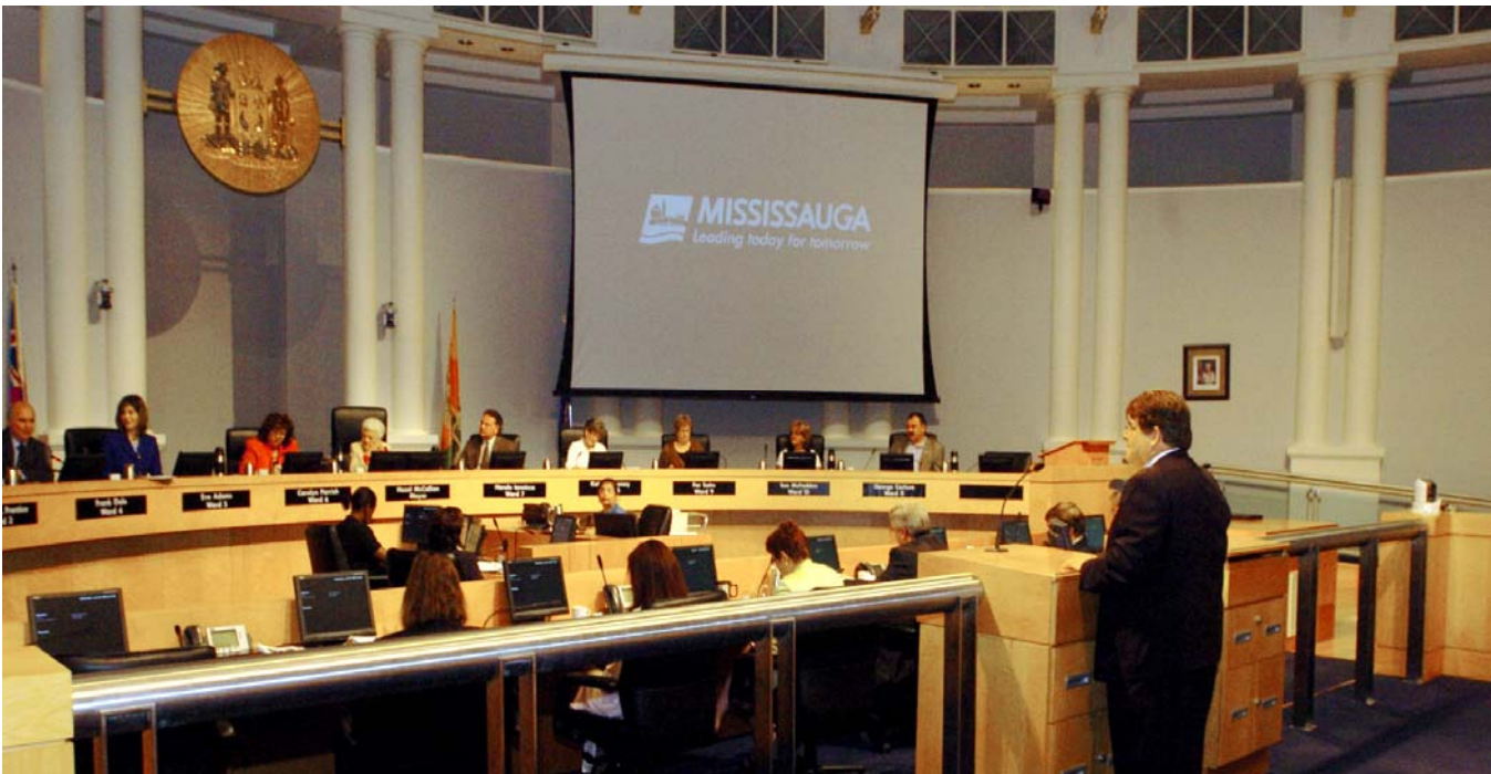
Figure 19-1: Development applications are subject to a number of criteria and require extensive review. Once the application is reviewed with all supporting documentation, the application is presented before City Council for approval.

19.4.2 To ensure that the policies of this Plan are being implemented, the following controls will be regularly evaluated: