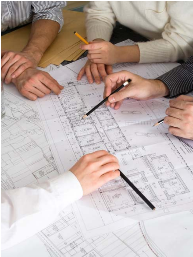
Figure 19-3: Applications for Site Plan Approval will be required to contain sufficient information to ensure compliance with all relevant matters contained in the Planning Act .

19.14.3 Energy conservation, aesthetic, and functional design guidelines will be established to assist in the preparation of site plans and the design of buildings.