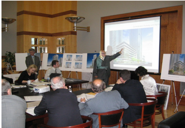
Figure 19-4: A Design Review Panel may be created to provide advice on applications, specifically design related matters that may affect the public realm. Development proponents may be required to submit their application to this Panel for review.

19.17.1 Mississauga will encourage and recognize creativity; sustainability and design excellence in