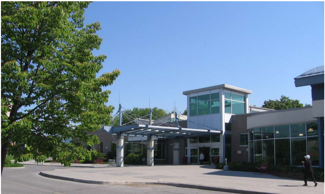
Figure 19-5: Mississauga has many beautiful parks and recreational facilities, such as the Frank McKechnie Community Centre and Library, located in the Hurontario Neighbourhood Character Area. In addition to City reserves, development contributions also play an important role in the creation of open spaces and recreational facilities for all residents to enjoy.

19.17.3 Mississauga may require development proponents to submit their application to the Design Review Panel.