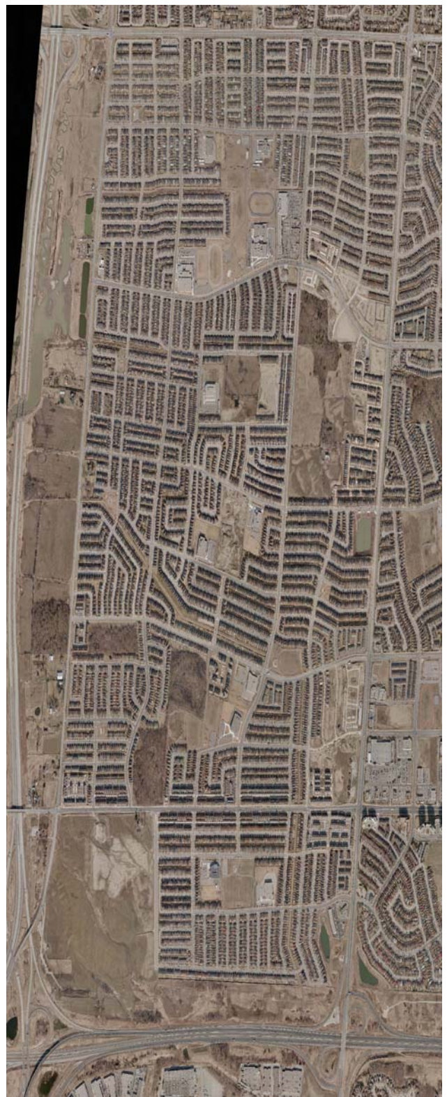
Figure 19-2: Although most of Mississauga is built-out, there are still portions of the city that will require a plan of subdivision. Churchill Meadows is one of Mississauga's most recent communities that exemplifies good planning, with appropriate road connections, built form, servicing and a mix of uses.