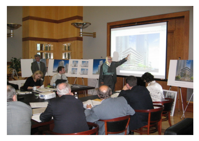
Figure 19-4: A Design Review Panel may be created to provide advice on applications, specifically design related matters that may affect the public realm. Development proponents may be required to submit their application to this Panel for review.

19.17.1 Mississauga will encourage and recognize creativity; sustainability and design excellence in architecture; landscape and urban design and stimulate public awareness by: