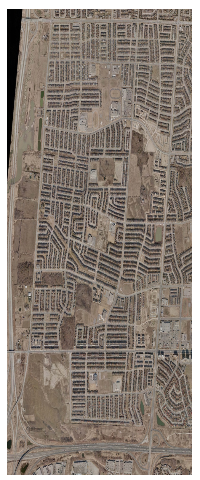
Figure 19-2: Although most of Mississauga is built out, there are still portions of the city that will require a plan of subdivision. Churchill Meadows is one of Mississauga's most recent communities that exemplifies good planning, with appropriate road connections, built form, servicing and a mix of uses.