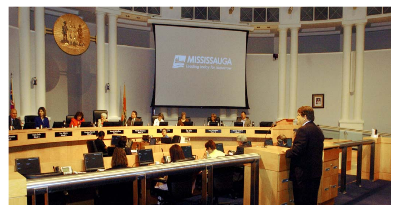
Figure 19-1: Development applications are subject to a number of criteria and require extensive review. Once the application is reviewed with all supporting documentation, the application is presented before City Council for approval.

19.4.2 To ensure that the policies of this Plan are being implemented, the following controls will be regularly evaluated: