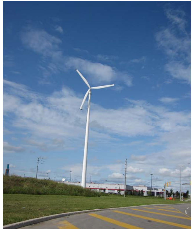
Figure 10-11: A 31 m wind turbine unveiled at the Lisgar GO Station in April 2009, generates as much as 80 per cent of the station's power. The site, located at Tenth Line and Argentia Road, was chosen for the wind turbine because of heavy prevailing winds from the west and its open fields.

10.7.10 Mississauga will work jointly with other levels of government and other agencies to investigate the need, feasibility, implications and suitable locations for renewable energy projects and to promote local clean energy generation, where appropriate.