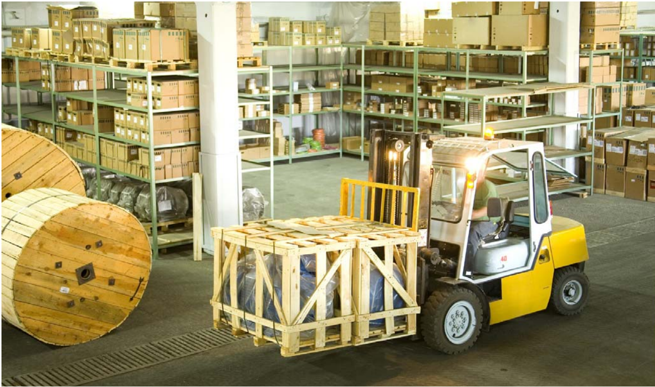
Figure 10-5: Mississauga is home to many warehousing and distribution centres, providing many employment opportunities within the city. These types of uses, along with other industrial uses, are best served by locating within Employment Areas away from sensitive land uses.