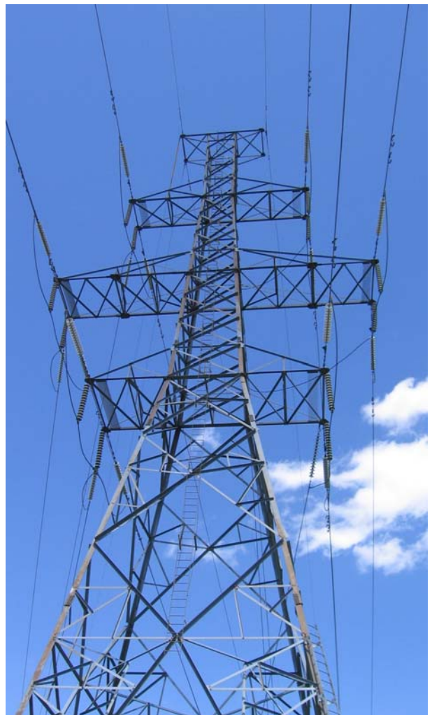
Figure 10-10: Mississauga Official Plan provides opportunities for power generation and distribution facilities situated in appropriate locations.

This Plan provides opportunities for power generation facilities to accommodate current and projected needs, where feasible, and recognizes the interdependencies that exist in the built and natural