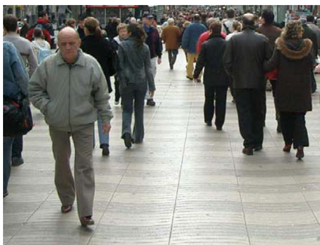
Figure 10-2: Retaining areas for employment purposes is vital to the health and competitiveness of the city. As the city's population grows through intensification and redevelopment, it will be critical to maintain the existing employment base and to provide opportunities for future employment.

Mississauga is home to a well educated labour force. Ensuring that residents have access to opportunities to develop the skills and knowledge needed to meet the needs of the business community is critical to the city's continued economic success. Mississauga is home to The University of Toronto Mississauga and the Sheridan College campus in the Downtown. In addition to these post-secondary institutions, the City promotes the establishment of new universities and colleges so that local students have a variety of learning opportunities within their community. This will also attract new residents to the city to further their education, retain youth and encourage partnerships between academic institutions and businesses.