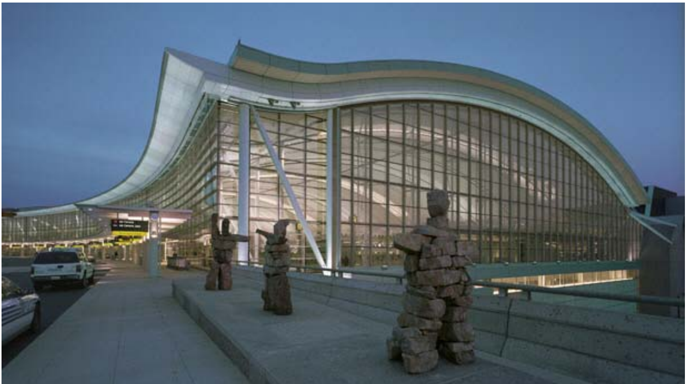
Figure 10-1: There are over 420 000 employment opportunities in Mississauga providing jobs for local as well as regional residents. While the largest concentration of these employment opportunities is in the northeast quadrant of the city at the Airport and surrounding lands, Mississauga has a number of other thriving employment areas. Mississauga has been highly successful in attracting office employment and over the last 25 years the city has developed an average of approximately one million square feet of office space annually. (Robert Speck Parkway Business Area, Hewlett-Packard Building, Airport -Terminal 1)