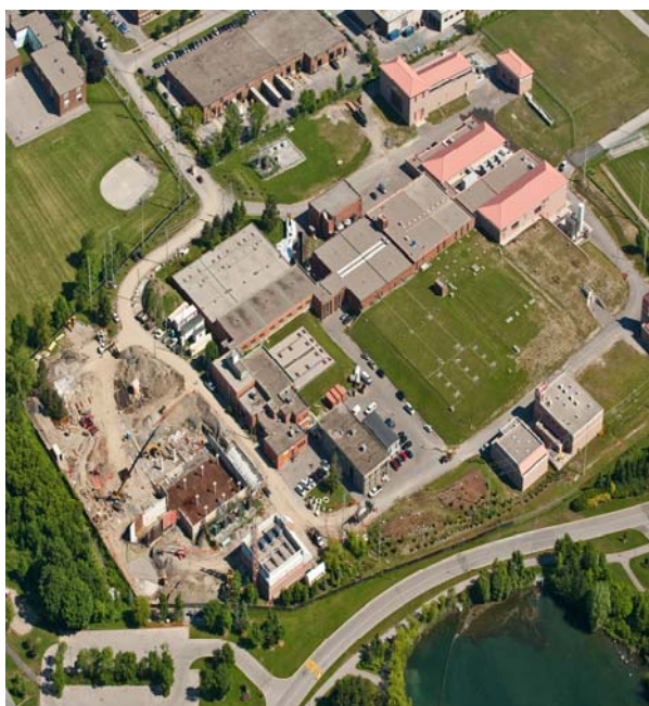
Figure 10-8: The 27 hectare Lakeview Water Treatment Facility is located on the shore of Lake Ontario in Mississauga and is operated by the Region. The Region has identified the need for a capacity expansion of the facility as a result of increased growth to serve the eastern part of Peel and to meet servicing requirements in York Region. The expansion of the Lakeview plant will increase capacity to produce 1 150 million litres of water per day.

10.6.8 Mississauga will maintain and establish programs for renewal of infrastructure and utilities. In doing so, Mississauga will ensure that the capital cost, maintenance cost and environmental impact are minimized. Opportunities for reusing pre-existing infrastructure and utilities for new purposes will be encouraged.