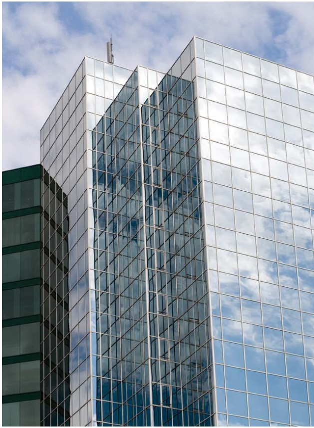
Figure 10-4: Over the years Mississauga has been able to attract many diverse businesses. Many of these offices have concentrated in the city's Corporate Centres, Employment Areas and Downtown. In the future, the City will promote increased office use and activity within the Downtown.

10.2.2 Secondary office within Employment Areas will be encouraged to locate within Major Transit Station Areas and Corridors .