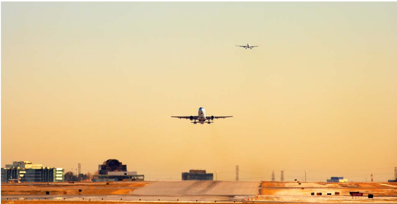
Figure 10-9: The Airport contributes to the success of the city's economy. The Airport's economic benefits transcend the Airport area to local distribution centres, logistic businesses, courier companies and transportation companies, among others.

10.6.17 Setbacks of a residence, place of work, or public assembly to an oil or gas easement or associated structure, and an appropriate building design, will be determined based on the type of pipeline, stress level of the pipeline and shall take into consideration the Guidelines for Development in the Vicinity of Oil and Gas Pipeline Facilities, prepared by the Technical Standards & Safety Authority.