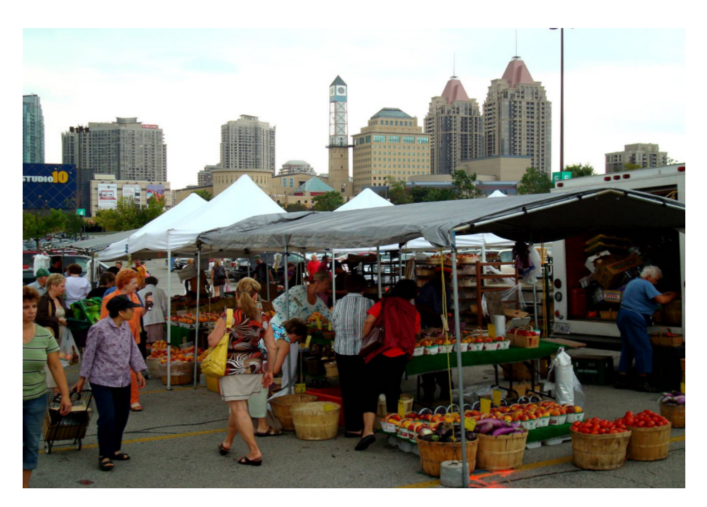
Figure 1-1: Formed in 1974, Mississauga is recognized as Canada's sixth largest city and Ontario's third largest city, with a population of over 730,000 residents representing cultures from around the world. Mississauga has many attractions and events that run at various times throughout the year. The Downtown is a central spot for activities, including the Farmers' Market.

Mississauga Official Plan provides a new policy framework to protect, enhance, restore and expand the Natural Heritage System, to direct growth to where it will benefit the urban form, support a strong public transportation system, and address the long term sustainability of the city. Mississauga Official Plan will be an important instrument in city building. All change within the urban environment will be considered for its capacity to create successful places where people, businesses and the natural environment will collectively thrive.