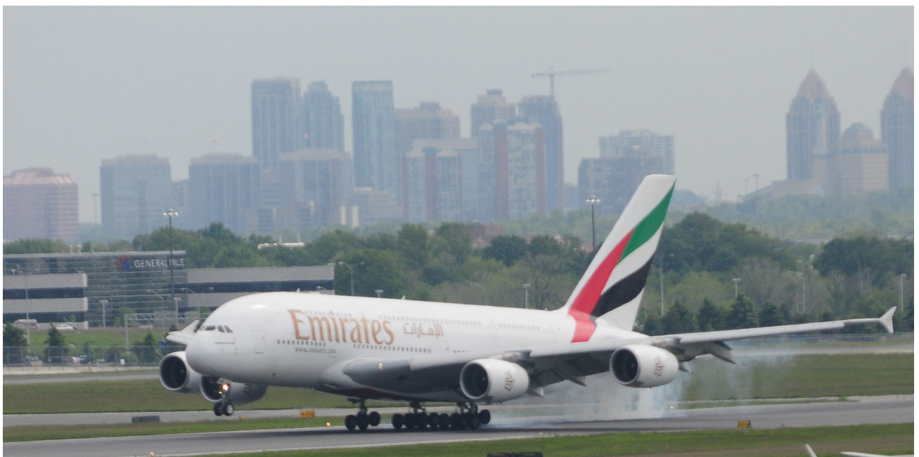
Figure 8-12: The Airport supports the local and regional economy and is a significant component in the city's transportation network.

8.9.2 Mississauga will support goods movement access to the Airport to promote the Airport as a key goods movement hub.