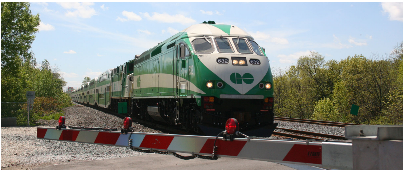
Figure 8-11: The rail corridors in Mississauga are shared by both freight and passenger trains, such as the GO train depicted above. The City recognizes these corridors as assets in the transportation system.