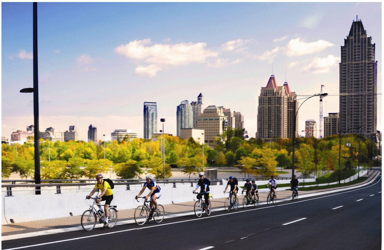
Figure 8-1: Mississauga promotes a range of transportation modes. In addition to providing for the car, facilities for transit, cycling, and walking are a priority. Promoting a range of transportation choices will be particularly important in areas where intensification is encouraged, such as in the Downtown.

Mississauga is evolving from a city that has a suburban, vehicle oriented built form to a more urban municipality. The transformation of the transportation system to meet the needs of the future is not without significant challenge. Mississauga's transportation infrastructure, which is largely built and relatively new, was designed around a grid of widely spaced major