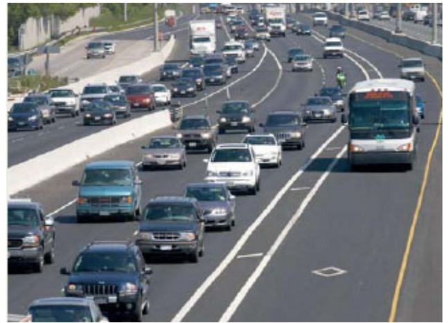
Figure 8-8: High Occupancy Vehicle (HOV) lanes such as those on Highway 403, encourage people to carpool or take transit.

8.5.4 Mississauga will manage parking in Intensification Areas to encourage the use of alternative modes of transportation and the reduction of vehicular congestion.