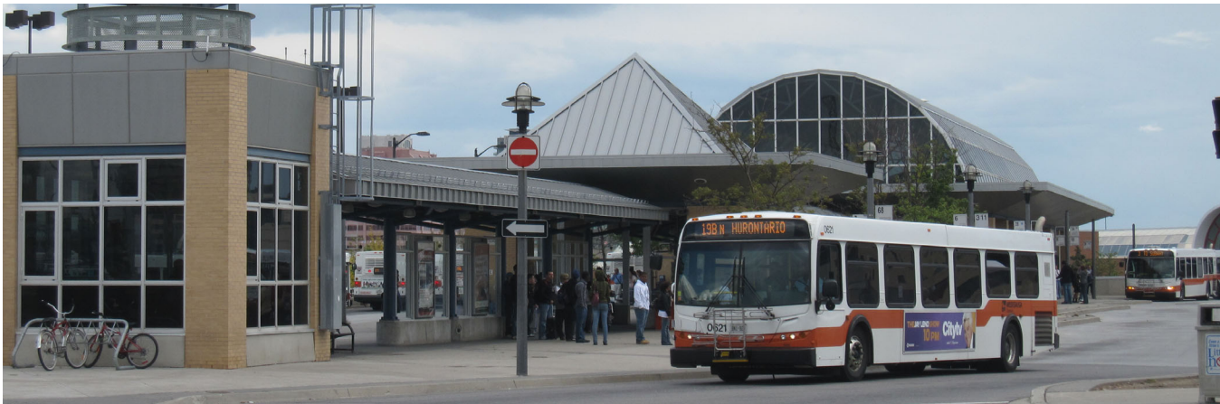
Figure 8-5: Various transportation forms exist within the city. The transit network is extensive and serves the large resident population and employment base, as well as those passing through the city.

8.2.3.3 Mississauga Transit will connect to commuter rail services operated by GO Transit that provide access to downtown Toronto and other destinations within the region.