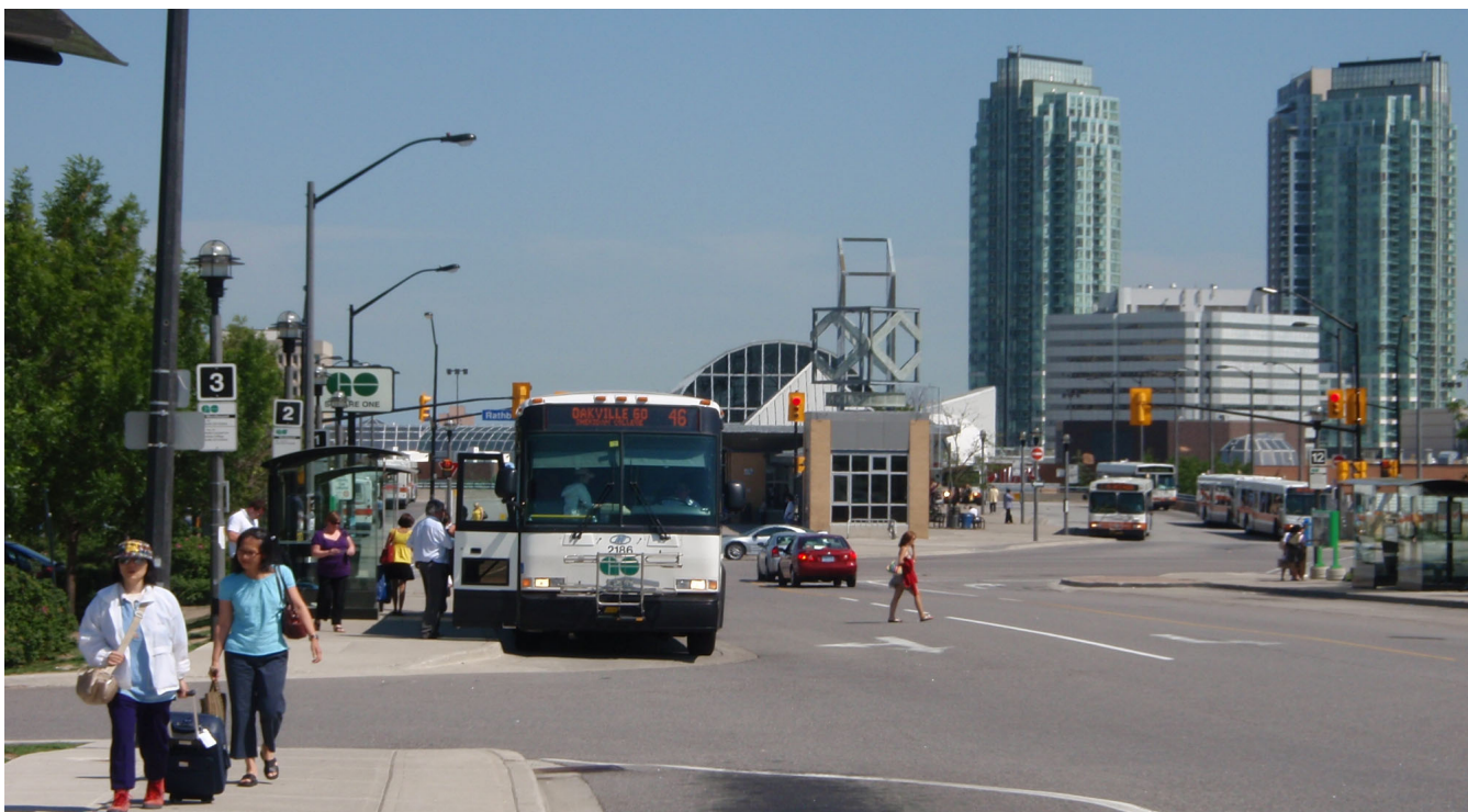
Figure 8-9: The Downtown Core Mobility Hub is an example of where people can live, work, shop and recreate in a mixed use environment supported by transit.