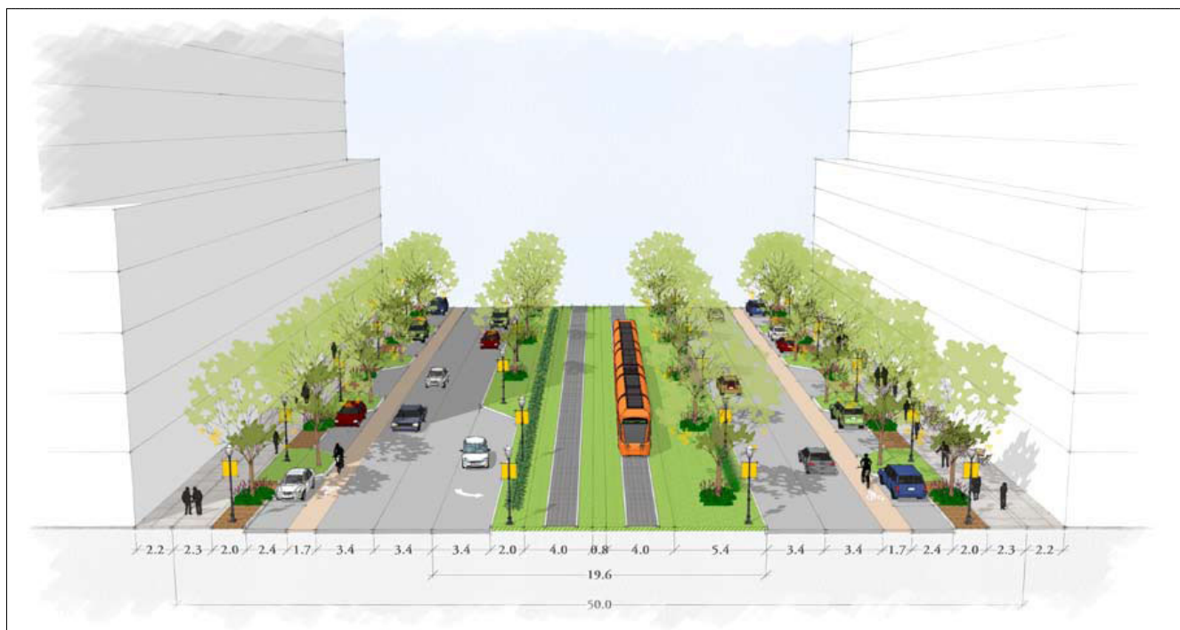
Figure 8-2: Higher order transit is proposed along Hurontario Street and will complement intensification. The illustration shows the City's vision for higher order transit along Hurontario Street.

While arterial roads will continue to move large volumes of traffic, the design of these thoroughfares must be sensitive to surrounding land uses. Arterial roads in employment areas will continue to prioritize goods movement, to support the vital role the transportation system plays in the economic health of the city. This will contrast with transportation priorities in Intensification Areas, where the needs of transit, pedestrians and cyclists will be in the forefront. In Intensification Areas, transportation decisions will support the creation of a fine grain street pattern, low traffic speeds, a mix of travel modes and attention to the design of the public realm.