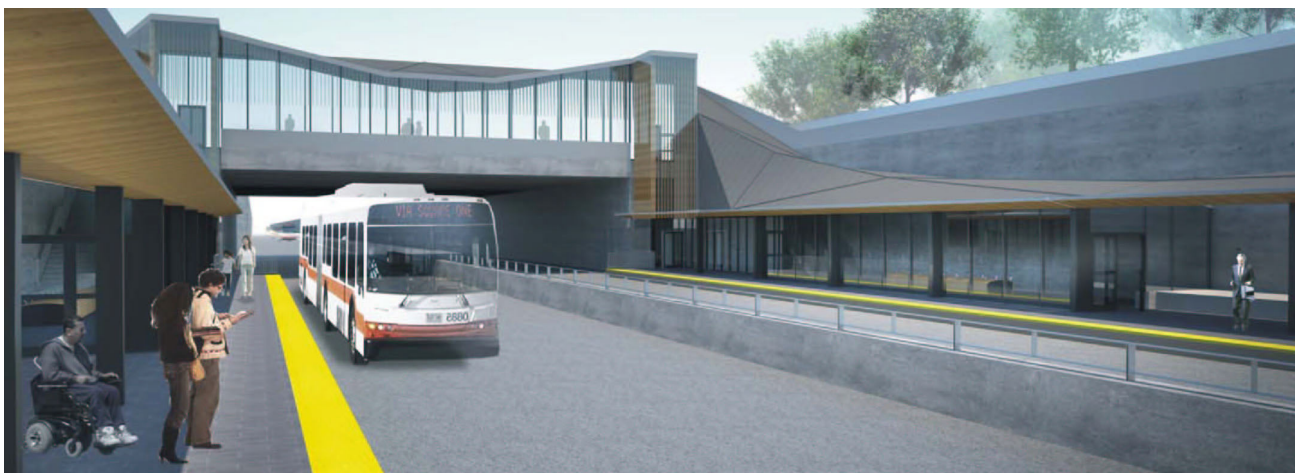
Figure 8-4: Higher order transit such as the Highway 403/Eglinton Bus Rapid Transit will provide competitive alternatives to the automobile.

8.2.3.2 Mississauga will operate a network of local grid services on major roadways and local feeder routes, which are connected at key transit terminals and commuter rail stations.