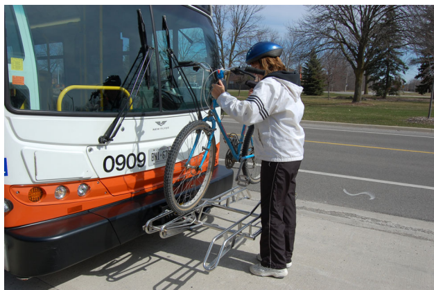
Figure 8-6: People often use multiple modes of transportation in their daily commute. Supplying bike racks on buses is one example of how Mississauga supports cycling.

8.2.4.2 Mississauga will protect and may acquire the